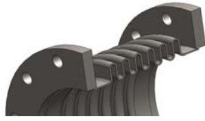
Style 44 (Fixed 150# Plate Flanges)